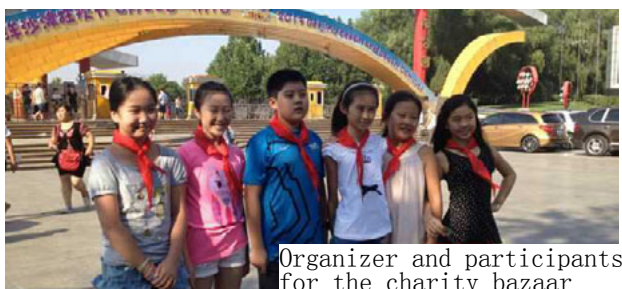
Organizer and participants for the charity bazaar