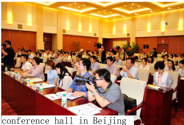
conference hall in Beijing