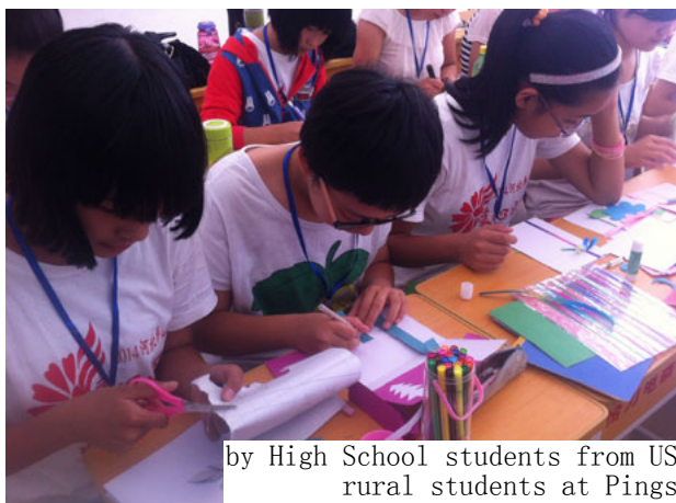
by High School students from US had culture exchange program with rural students at Pingshan County, Hebei Province.