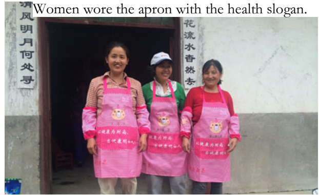
Women wore the apron with the health slogan.

The AiXin keeps communicating with Xin County frequently. We coordinate experts to Xin County for training health educators (social workers) and giving lectures in communities and schools every month according to the strategy of the project. This kind of lectures and trainings has been held for 39 times until