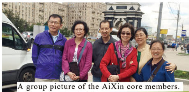
A group picture of the AiXin core members.