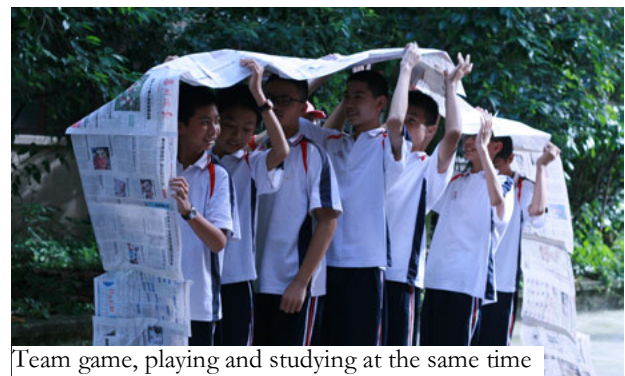
Team game, playing and studying at the same time