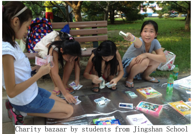
Charity bazaar by students from Jingshan School

of 2013. Many exquisite postcards drawn carefully by kids were sold, and the income donated to Central Primary School in Anhui Province Shitai County Renli Town.