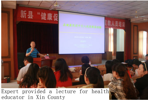
Expert provided a lecture for health educator in Xin County

the policies with health, and construct a system for public health based on household and communities. In May 2014, Xin County Health Education and Health Promotion Committee was established. The committee was formed by the heads from all of governmental departments and each town, and the director was the governor of the country. After that, the project became a part of the national project “National Health Promotion County”.