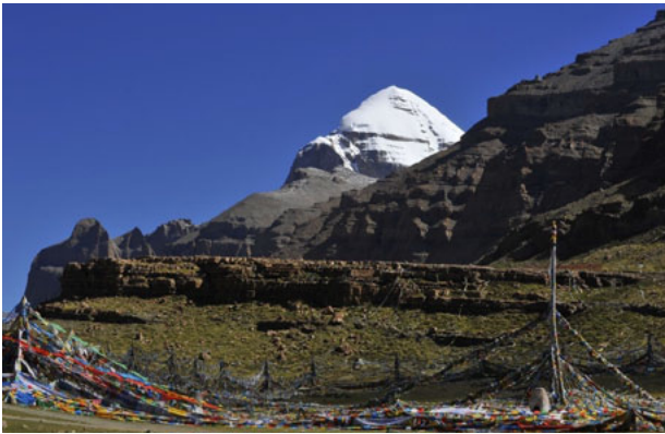
To a pilgrimage aroundMount Kangrinboqê

AiXin Education Program as received much warm hearted support from Chinese volunteers in many ways. An example is the story of Wei qian and Lu Lijuan, a couple whose interests include travel and photography and have visited Tibet three times, donated all the income from their photography < To a pilgrimage around Mount Kangrinboqê> in 2013. They sincerely want to help students from poverty-stricken areas to continue their study through AiXin Education Aid Project supported by AiXin Fund. It deserves to be mentioned that Lijuan as a volunteer of AiXin Education Aid Project went to Anhui Shitai twice to visit recipients personally. She wrote that “we hope that the students receiving aid, especially disabled