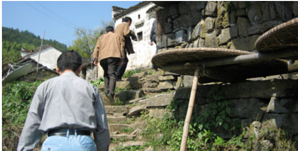
AiXin Volunteers on the way to visit the students’ home

“ If it were not for you, there may not be the present ‘me.’ I don’t know how to describe my feeling to you. It may be kindness, or may be more than kindness.”