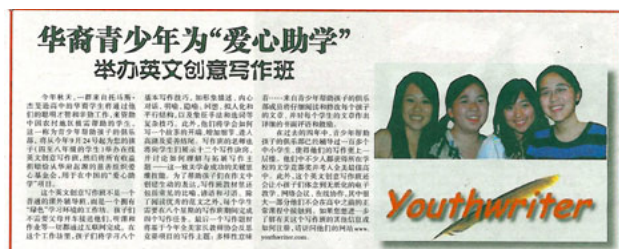
Donation from the “Teens Help Kids Club” by students of Thomas Jefferson High School.