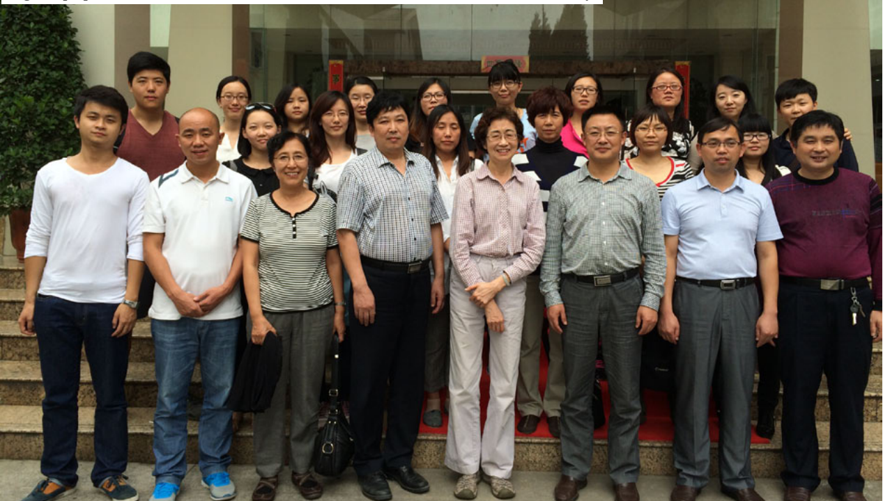
A group picture of the Health Promotion Team in Xin County

During this process, we also encounter kinds of issues, such as, the absence of young in rural area due to the migrant work, the awful financial condition, the low-level education, and the neglect on health. Besides, the ability of the workers on healthy propaganda should be enhanced, and it takes time to establish a steady organizational due to the combination of the departments of health and sanitation. We'll keep a close cooperation with the local government, and adjust the plan according to the unpredictable conditions in the future. We hope that the project could be completed successfully as a result of our efforts and insistence.