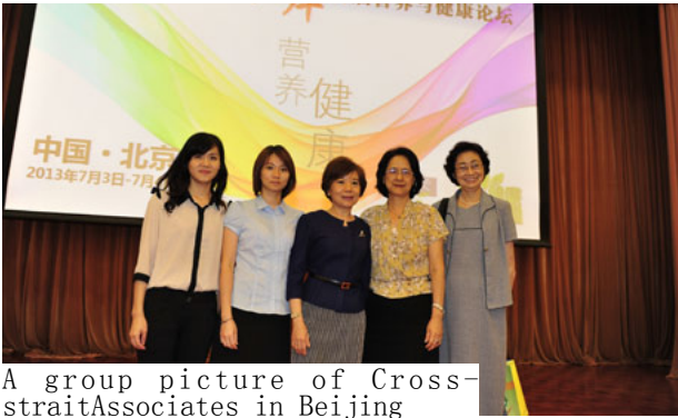
A group picture of Cross-strait Associates in Beijing