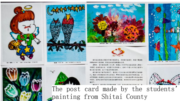
The post card made by the students' painting from Shitai County

Another story is about kids to kids. Schoolchildren of fourth grade from Beijing Jinshan Primary School organized a charity bazaar for AiXin Education Project at Chaoyang Park in the summer