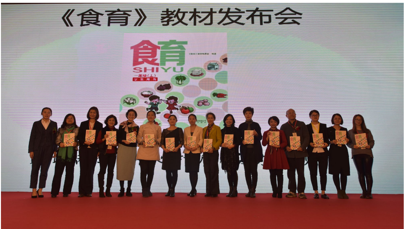
Nutrition education textbook is released