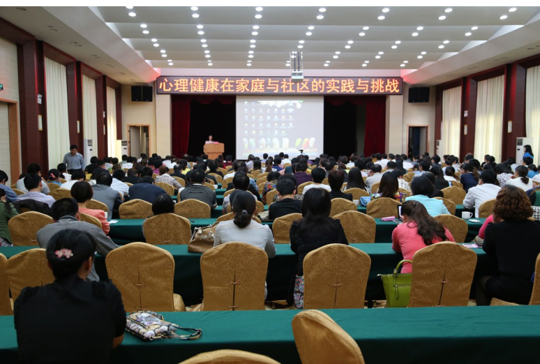
Health Education Training