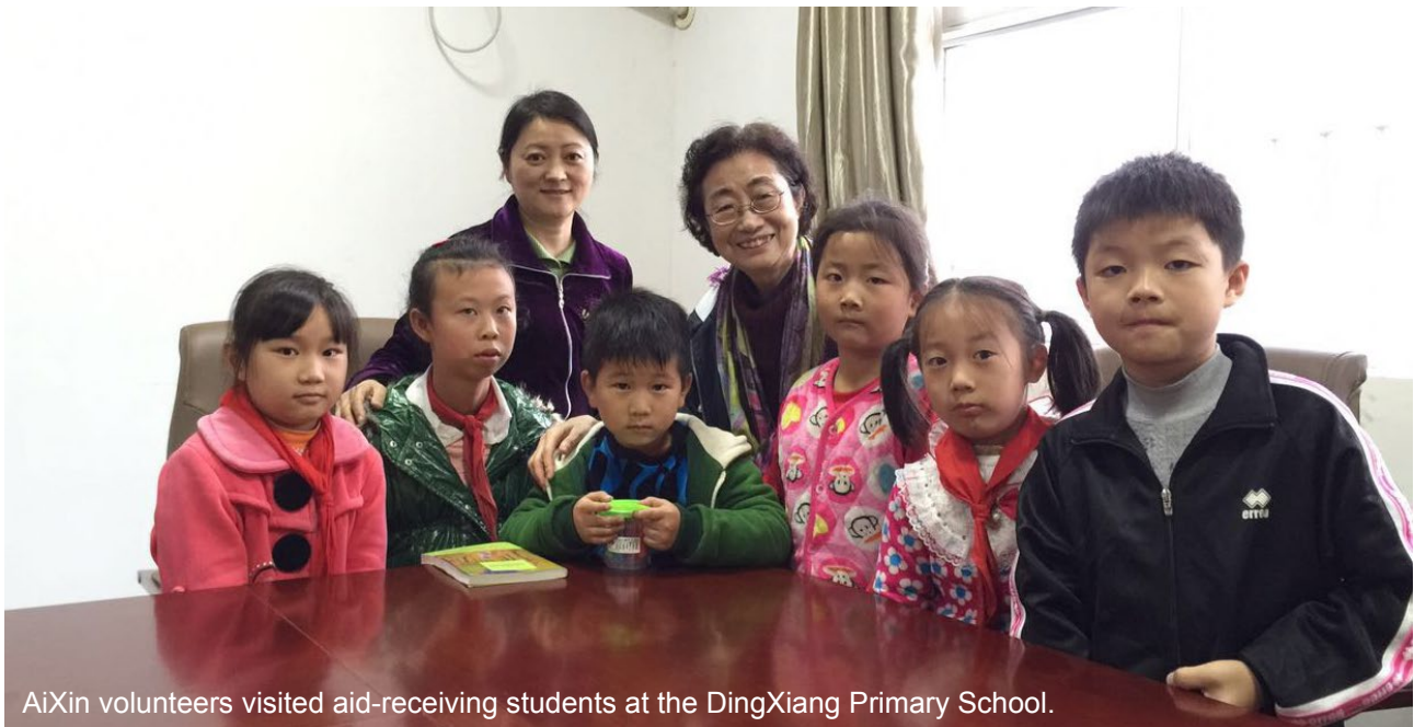
AiXin volunteers visited aid-receiving students at the DingXiang Primary School.