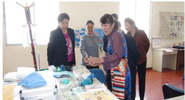
Tibetan students were in the class to learn about maternal and infant healthcare.