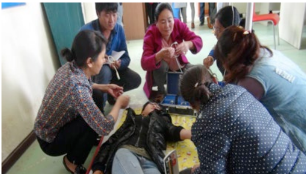
Students are learning first-aid knowledge

From 2010 to 2016, entrusted by the governments of all levels in Tibet, the Tibet's Mother & Child Health Association conducted 37 training classes. 1903 village medical staffs were benefited, over 50% of whom were local doctor. These village medical staffs come from over 2000 villages of 683 towns of 74 counties in Tibet. The training of village doctor, community health education program, free clinic, and community disability rehabilitation done by the association attracted extensive attention from the society and fully recognized over the years.