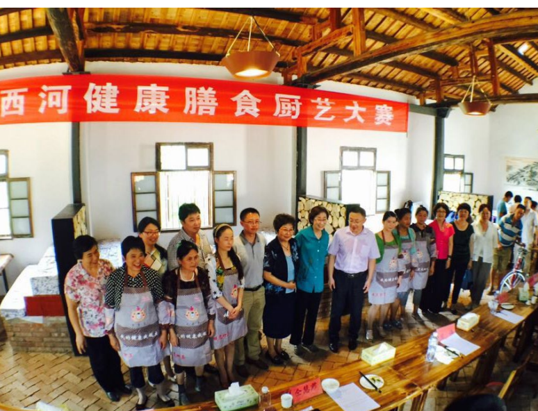
Healthy cooking skill competition in XiHe Village

as the coordinator and facilitator for all projects, was responsible for communicating the government, professional organization and expertise and also providing the necessary technical support. The projections were: establishing a stable leadership infrastructure for healthcare promotion, developing an local execution team, creating a training facility for healthcare education and exploring a system for consistent development and effective working platform.