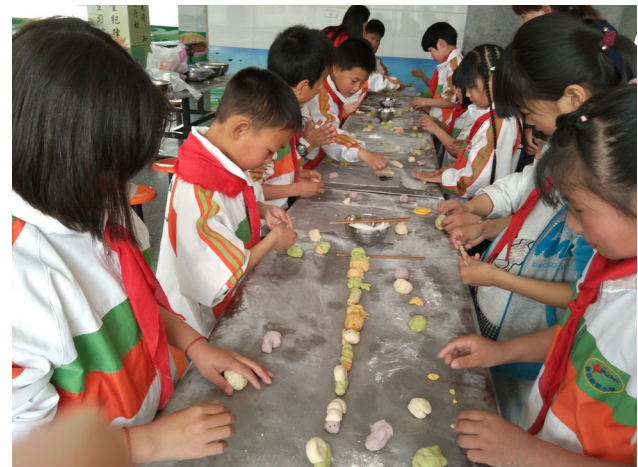
Make healthy food by students themselves