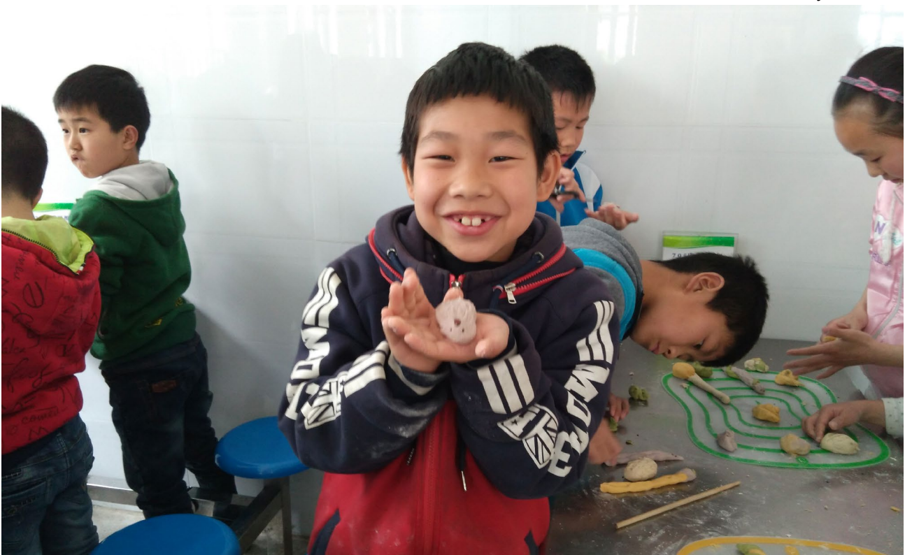
Creative steamed buns made by student