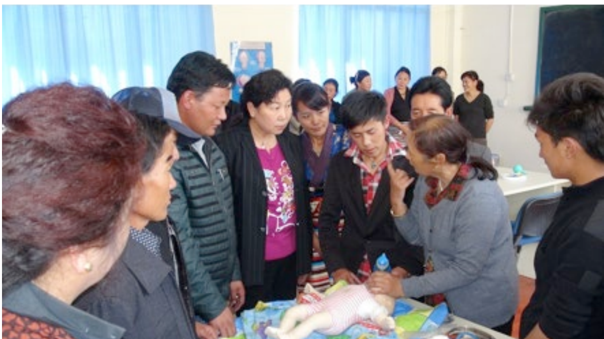
Introducing teaching molds by the head of Tibet's Maternal and Infant Healthcare Association.