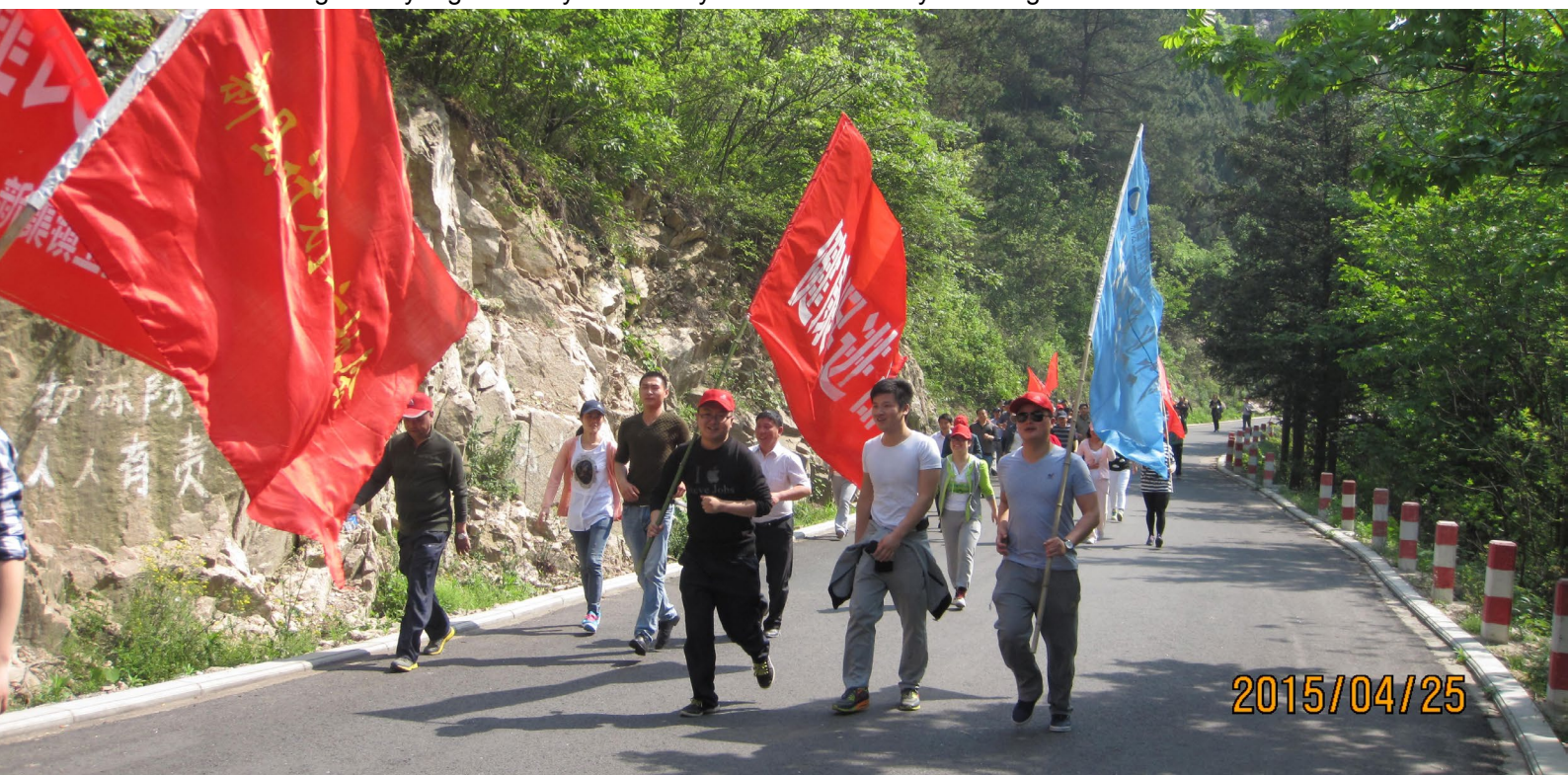
Fitness walking activity organized by Xin County Health and Family Planning Commission

With the consideration of people’s healthcare requirement and the easiest information channels, they are now broadcasting the health information through the most acceptable ways such as storytelling, lecturing and medical visits. The beneficiaries of these actions have reached to over 70% of total county population. They are expecting these effective approaches would create a systematic and standardized model of