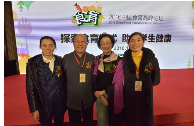
A group photo of the AiXin representative and volunteers on the Health and Nutrition Education Forum

more attention to the health of the left behind children” from 2012 in the western poverty area, late on become the Food Nutrition Education Initiative. It includes the research and development of curriculums, compiles teaching materials, trains teachers, and carries out pilot project in school and building program bases. The service station and interest classes are established around the country to implement the program. The program provides students with the nutritional education, cultivates their healthy dietary behaviors, expecting them to learn how to eat a balanced diet.