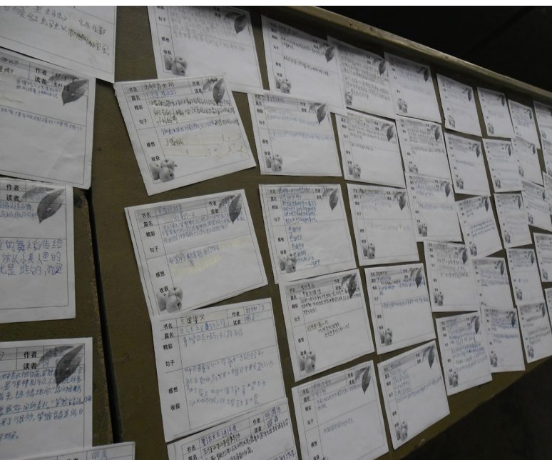
Students' borrowing book records

in exertion and self-cultivation, 20 percent in popular science and 20 percent in arts. All of these books are newly published, with good contents and high printing quality. The number of books is determined according to the number of the students, and then new books will be added in terms of the actual situation. A contest of reading achievement will be held each term by the class advisers or Chinese teachers in the same grade, with small prizes provided by AiXin to encourage them. Each school is required to submit a summary each term. Those that have finished the task will be continually provided with books the next term, while the failing ones will be discontinued.